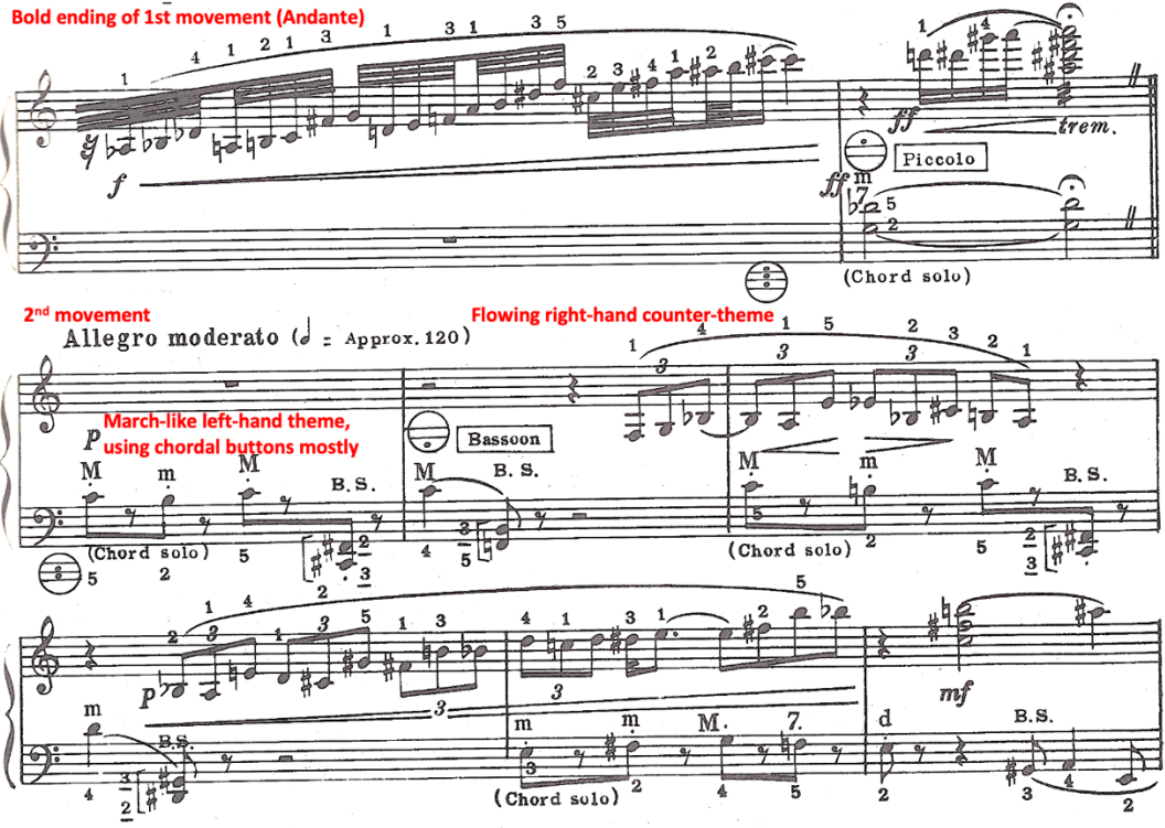
Example 2. Dramatic end of first movement (Andante) and double-themed beginning of march-like second movement, Allegro moderato