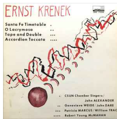
Record jacket for the Orion LP recording including the Toccata

Record albums of works by lesser-known composers are far less likely to attract critical published attention with such wide distribution.