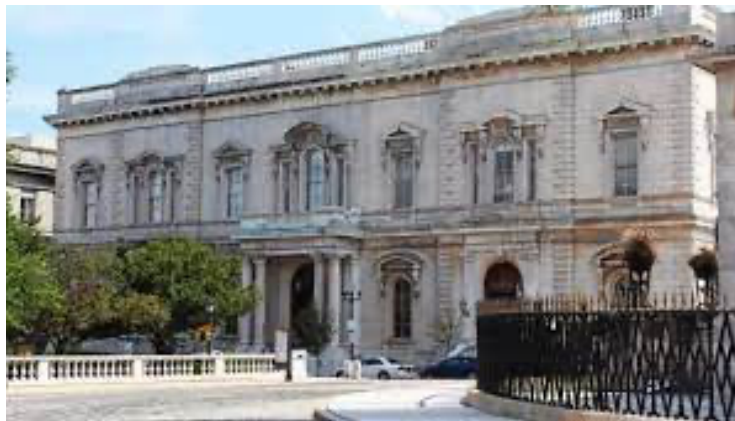
Peabody Institute of The Johns Hopkins University, Baltimore, Maryland, where Krenek first heard a performance of his Toccata for accordion

The recording received good reviews in popular recording magazines of the time including High Fidelity (June 1976)** and Tempo (September 1977). Because the Toccata was part of a collection of recorded works by one of the most renowned and still thriving composers of the twentieth century, it may have been, and may yet still be, the only AAA commissioned work to be so widely exposed to, as well as critiqued by, the general classical contemporary music world due to its exposure in these widely read periodicals.