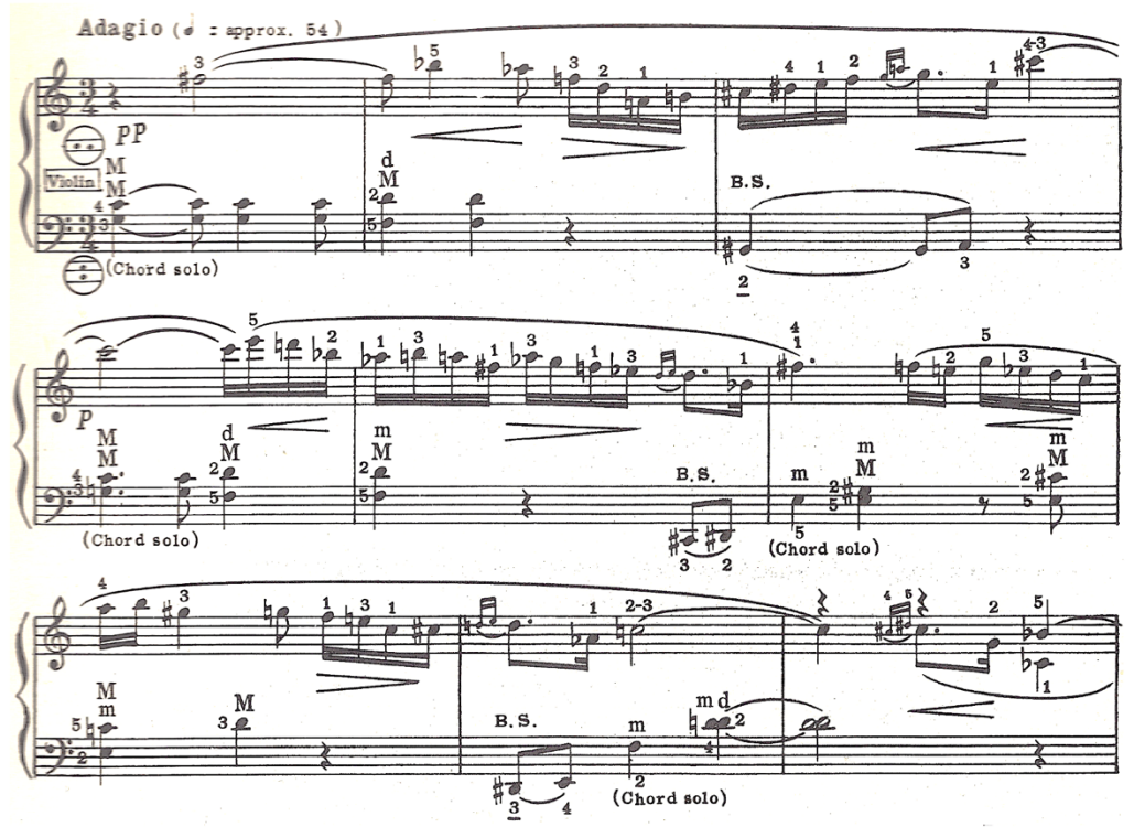
Example 3. Beginning of second movement (Adagio). Expressive, violinistic melody, using the gently bright sounding “violin” stop, with largely polychordal left-hand accompaniment created by combinations of chordal buttons in the stradella system employing the high, transparent sounding “alto” register switch.